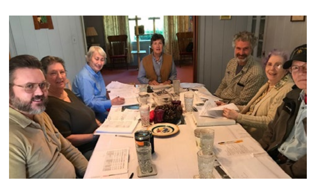
Big Thicket Natural Heritage Trust Board Meeting