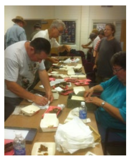
Mushroom Foray – Field Research Station