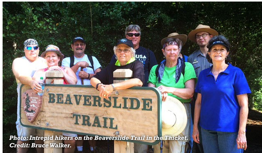
Photo: Intrepid hikers on the Beaverslide Trail in the Thicket.