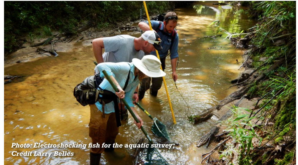
Photo: Electroshocking fish for the aquatic survey; Credit Larry Belles

The Texas Longleaf Taskforce hosted a field day on RMS and Alabama-Coushatta Tribal lands. Over 70 landowners and resource professionals gathered to tour the 400-acre restoration project and to discuss longleaf pine management and restoration. Topics for the day included the conversion of loblolly stands to longleaf stands, herbicide application, invasive plants, the importance of understory plants, and available cost-share programs. Elliott Abbey of the Alabama-Coushatta Indian Tribe shared with the group the history and craft of basket making using longleaf pine needles.