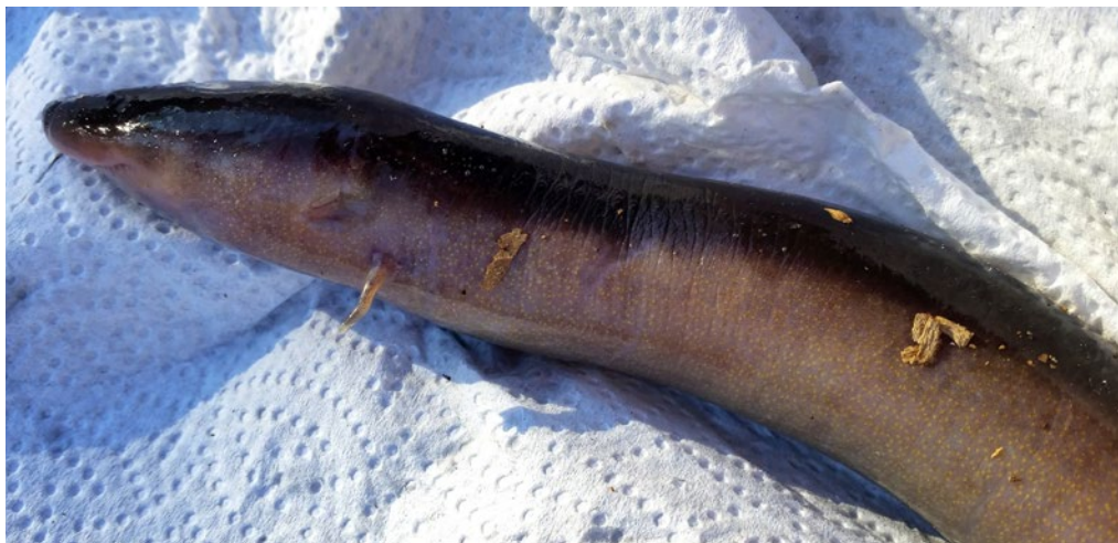
Photo: Close up of the head and leg of the amphibious creature retrieved from a crayfish trap