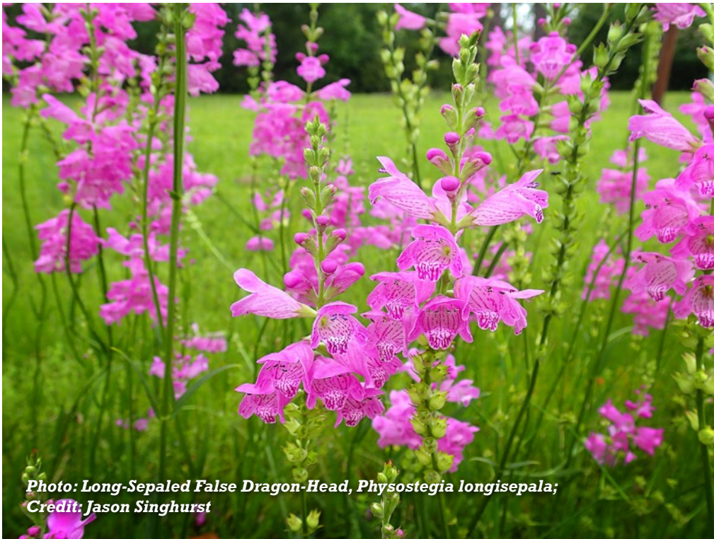
Photo: Long-Sepaled False Dragon-Head, Physostegia longisepala ; Crédit: Jason Singhurst