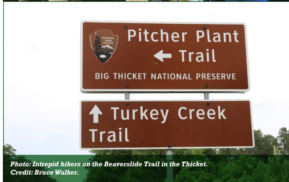
Photo: Intrepid hikers on the Beaverslide Trail in the Thicket.